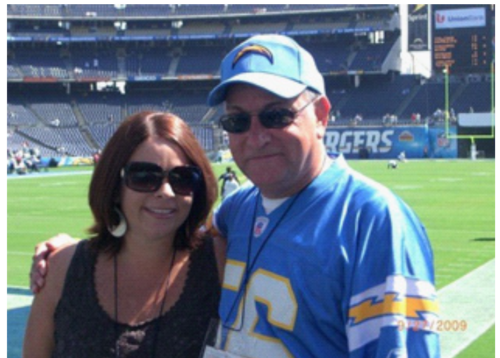
Charger Fan ....always