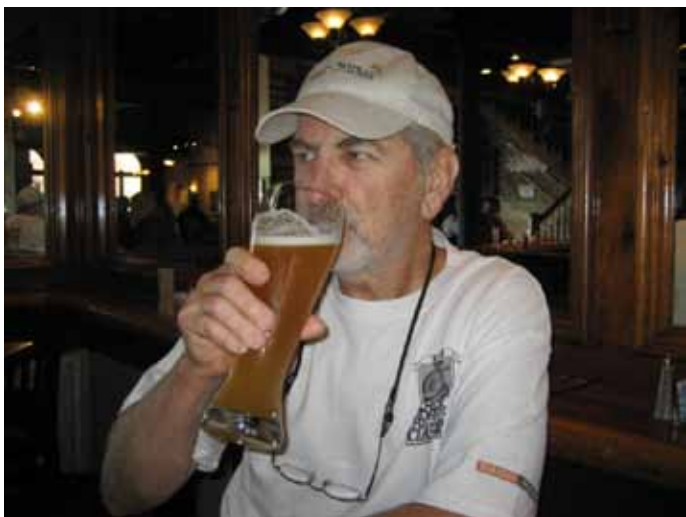
I'd be lying if I said that I didn't like beer. This is from some brewery on Bourbon Street, New Orleans