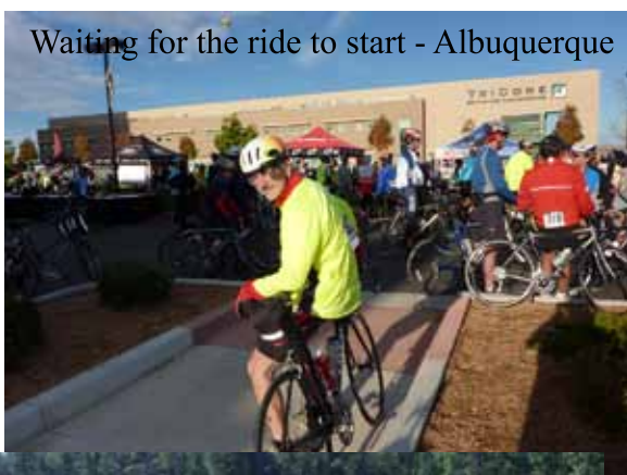
Waiting for the ride to start - Albuquerque