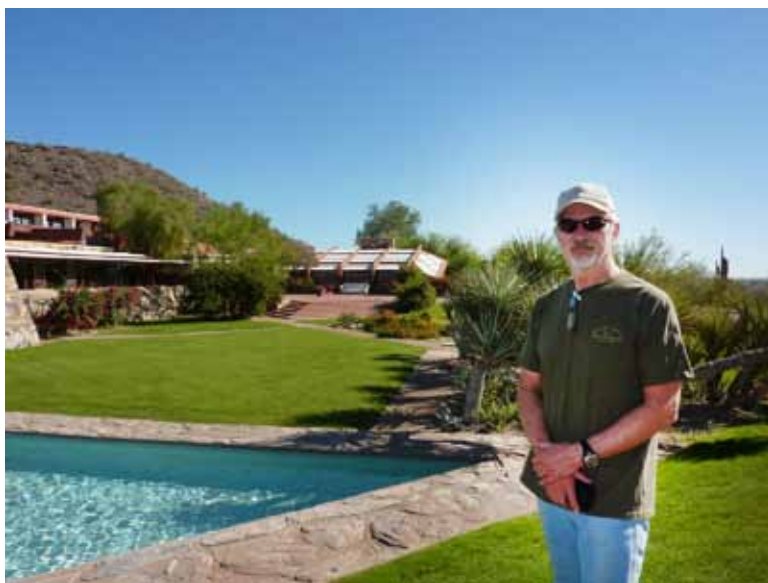
Outside of Frank Lloyd Wright's house - Scottsdale, AZ